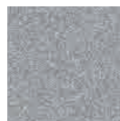
Aluminium Rich 9007