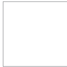
White Pure 9003