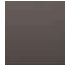
Brown Natural 7013