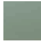
Green Sage 8715