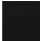
Black Classic 9005