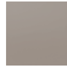
Brown Light 1236