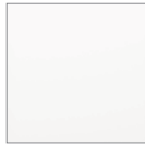
White Pure 9003