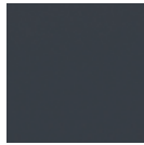
Anthracite Authentic 7016