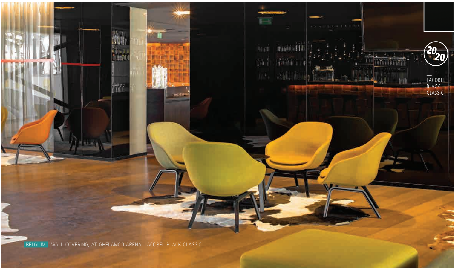
BELGIUM WALL COVERING, AT GHELAMCO ARENA, LACOBEL BLACK CLASSIC

perspectives. In the Matelac version their elegant, subtle charm creates a cosy atmosphere. Lacobel Red Luminous will liven up your interiors, while Matelac Silver Clear lends a sophisticated, restrained touch.