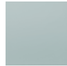
Grey Classic 7035