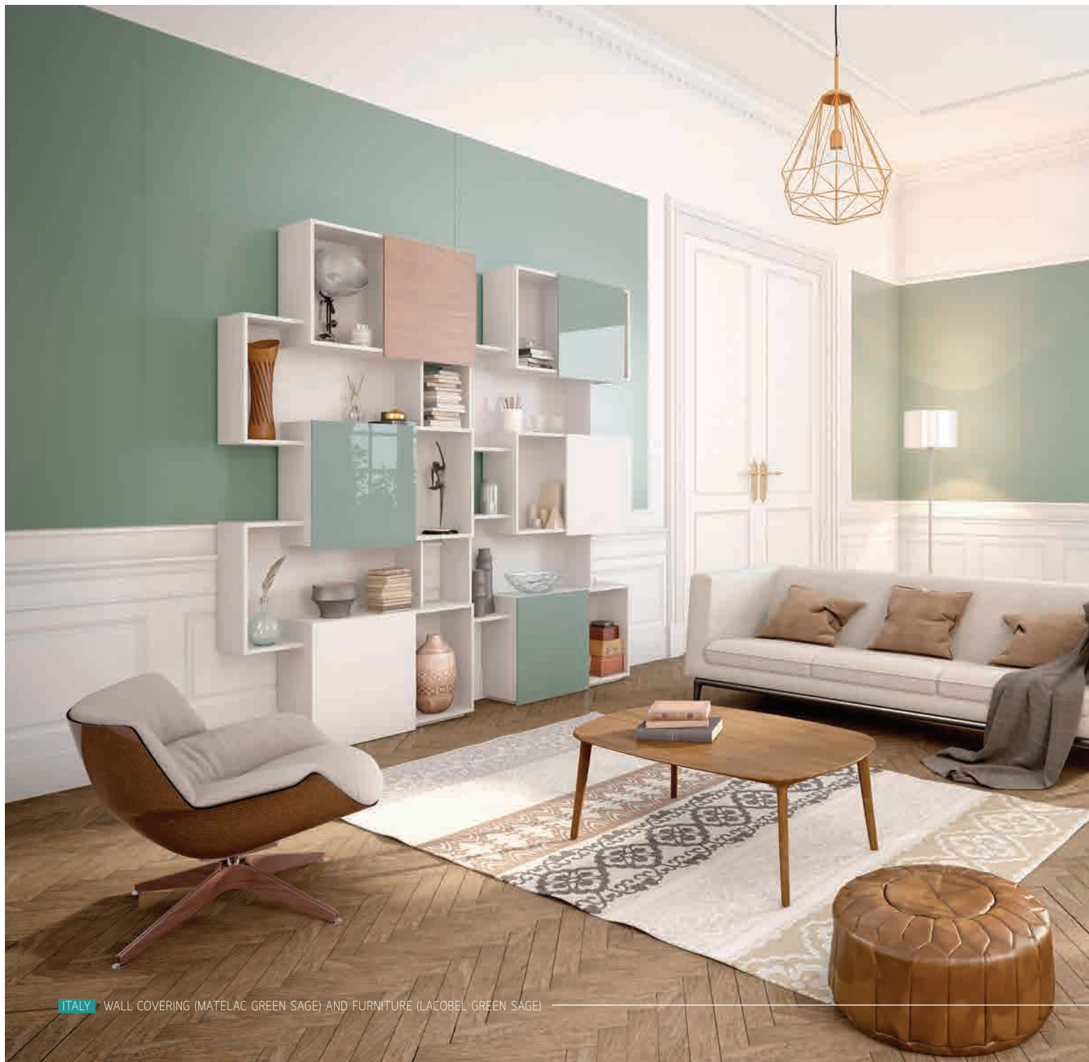
ITALY WALL COVERING (MATELAC GREEN SAGE) AND FURNITURE (LACOBEL GREEN SAGE)