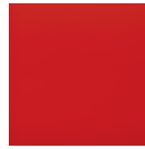
Red Luminous 1586