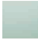
Green Soft 8615