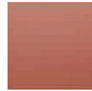
Red Terracotta 8815