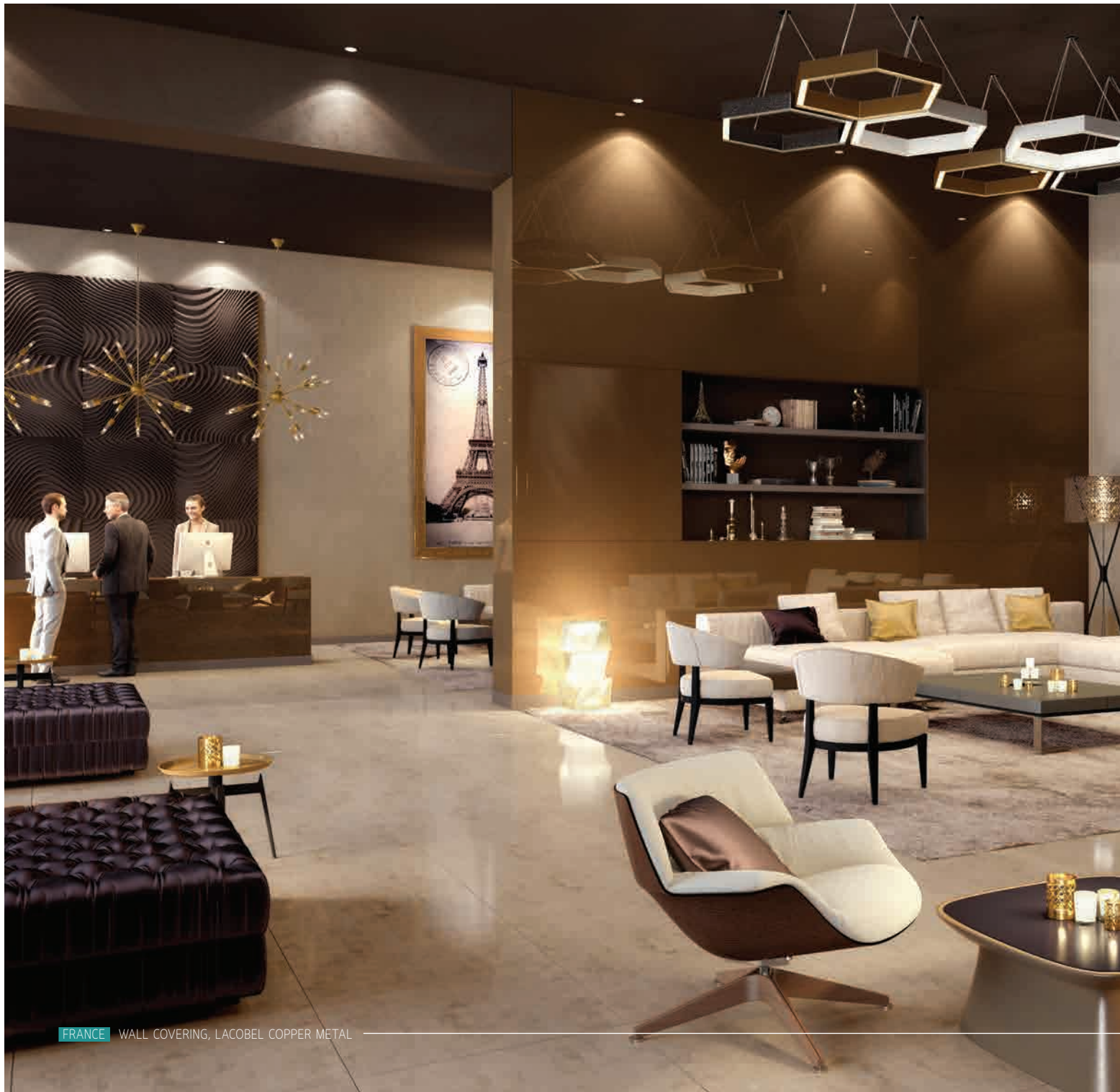
FRANCE WALL COVERING, LACOBEL COPPER METAL